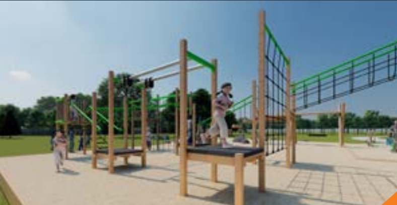
An artist's impression of how the new playground will look when complete.