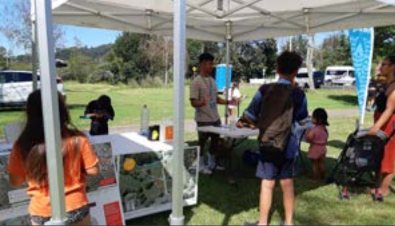
Community members attending a drop-in session for the new Raumanga Playground.