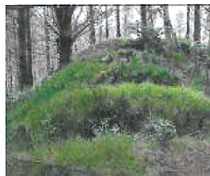
A flight of pits in forest