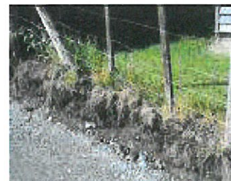
Shell midden uncovered in road scraping