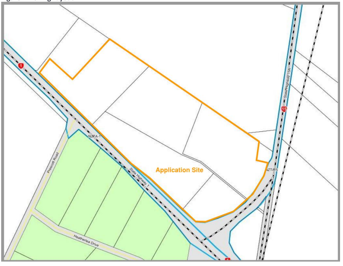
Figure 2: Zoning Layout

Figure 2 shows zoning at the application site and neighbouring sites ( Rural Living zones are illustrated in green; Rural Production zones are illustrated in white).