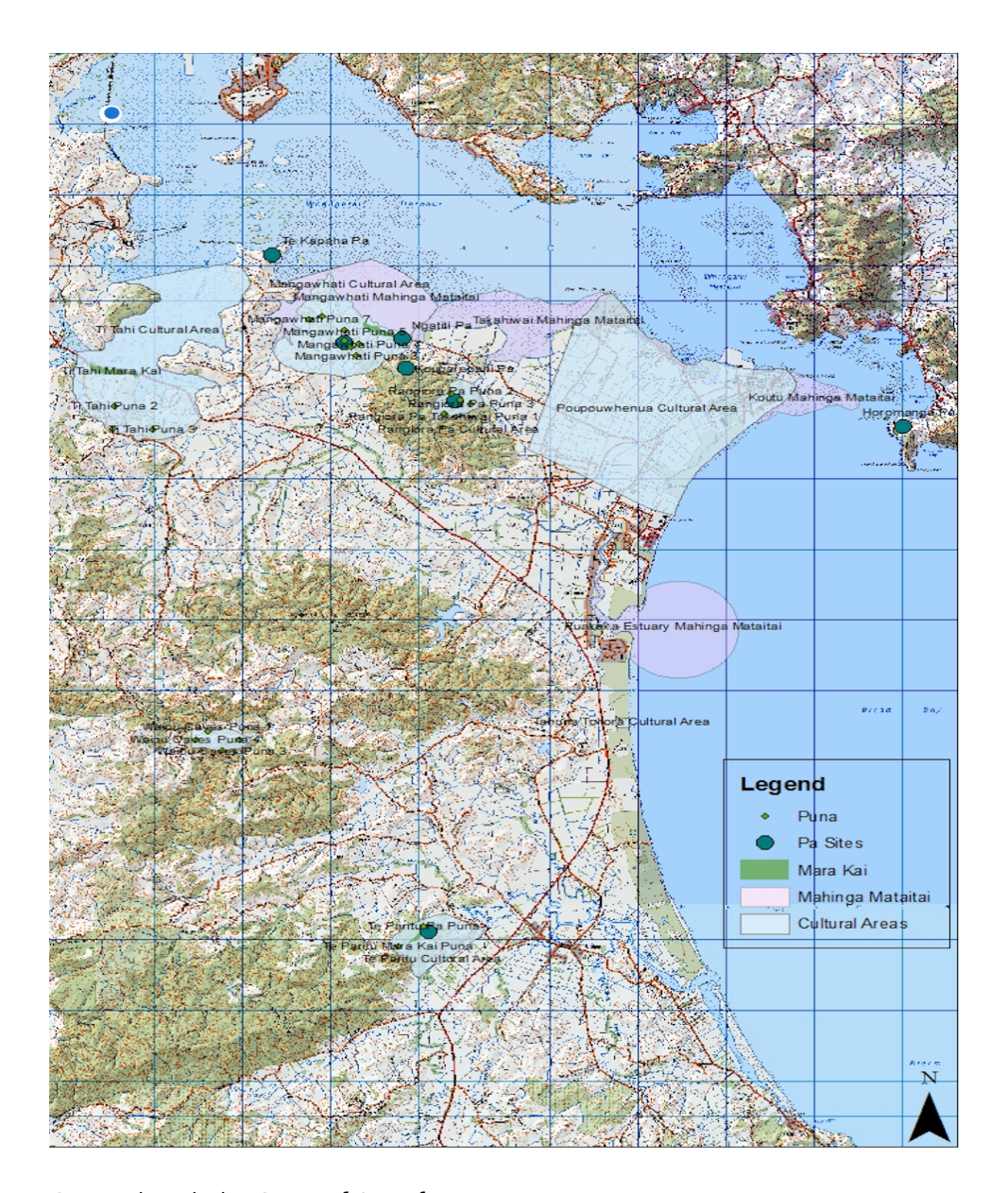
Figure 3: Patuharakeke Sites of Significance