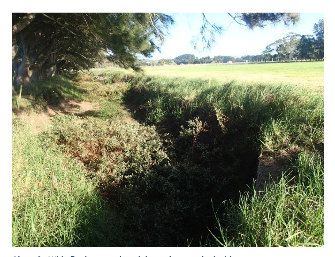
Photo 2. Wide flat bottomed straightened stream bed with water pepper.