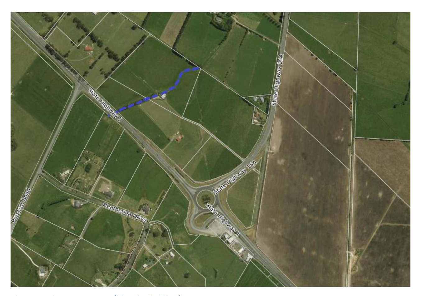
Figure 1. Site watercourse (blue dashed line)

The request was to assess the flow path under the provisions of the Northland Regional Plan, and to provide the information to inform the consent, including an assessment of ecological effects of the proposed works, mitigation of adverse effects and an assessment of fish passage under State Highway 1.