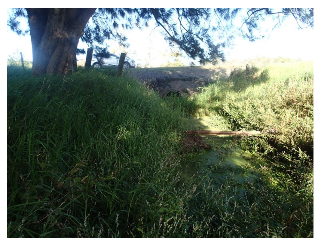
Photo 6. SH1 culvert outlet pool with pond weed in foreground transitioning to azolla. Pool divided by kikuyu covered fence wire at the boundary, partially obscuring culvert in background.