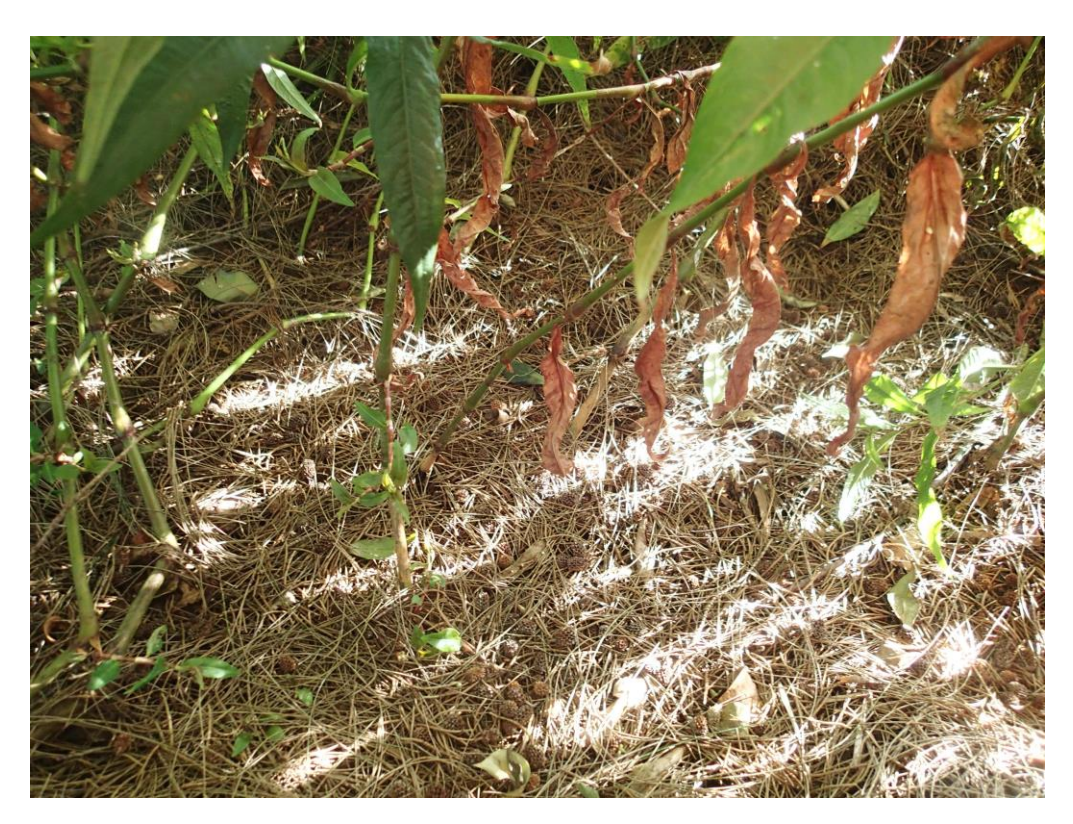
Photo 5. Dry stream bed covered by sheoak needles under the water pepper