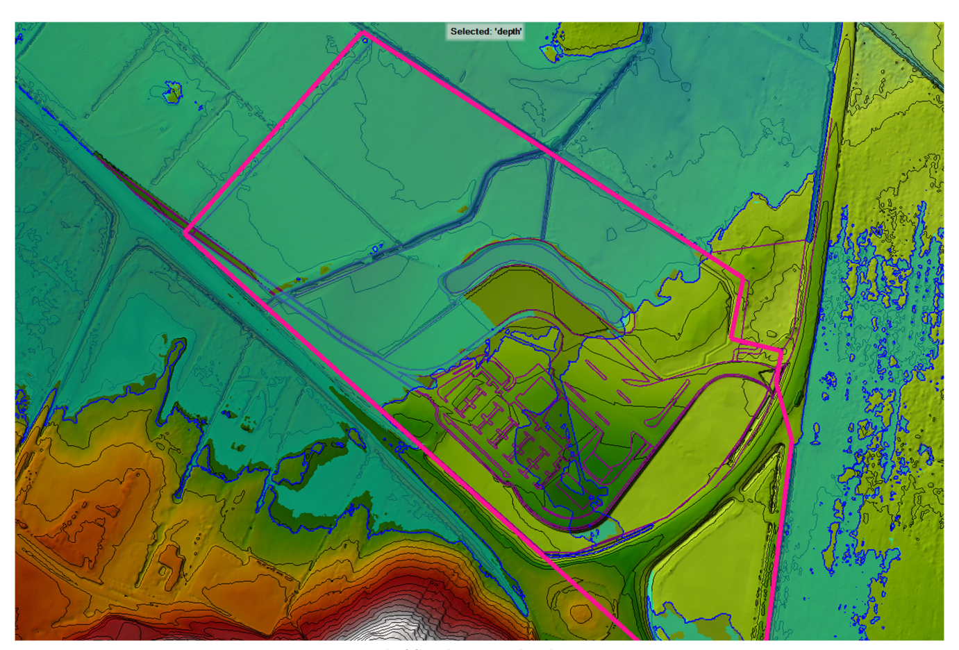
Figure 5: Extend of flooding post development

Yes, we anticipate overtopping at the culvert. Please refer to image below for clarification of the building areas and access from SH1 within the flood plain post development