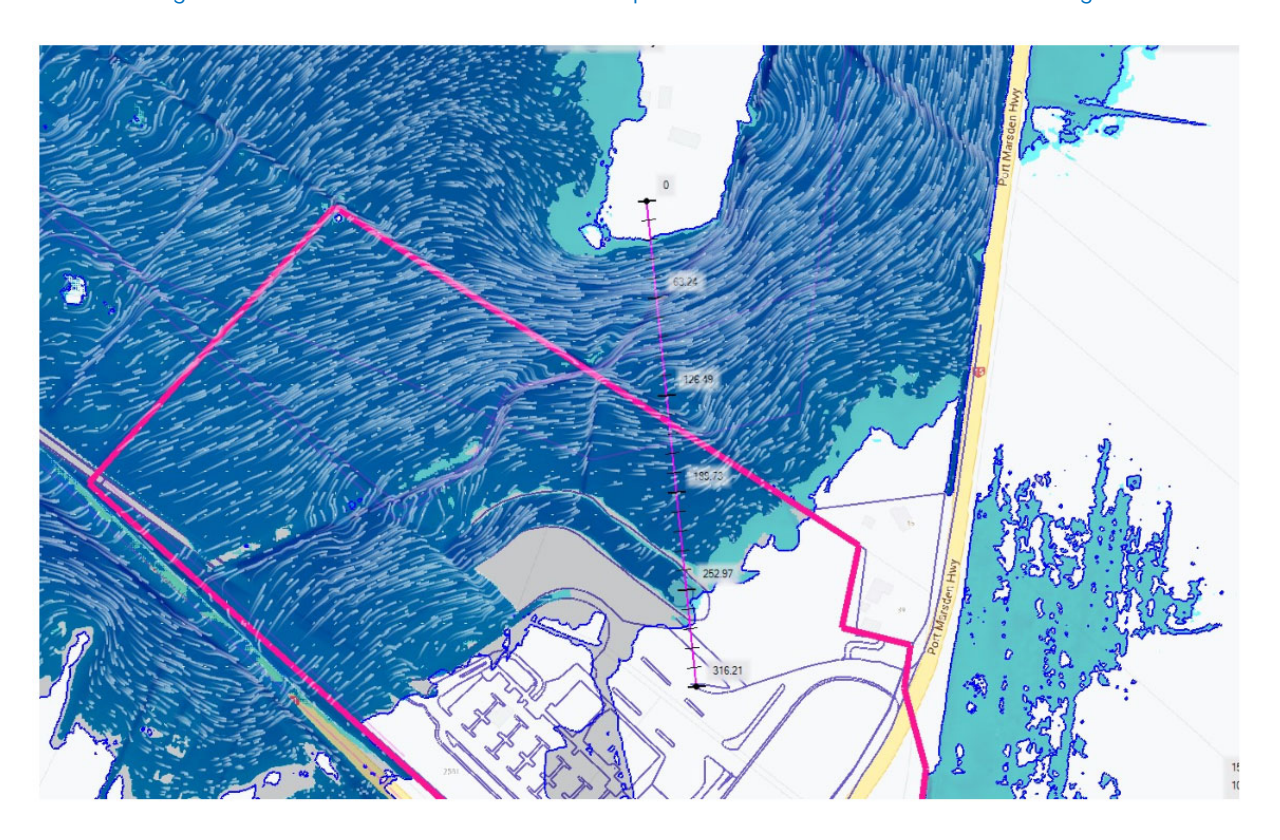
Figure 1: Downstream cross section & flood flow direction

Section through the site at the below location have been provided. Please refer to the attached image below: