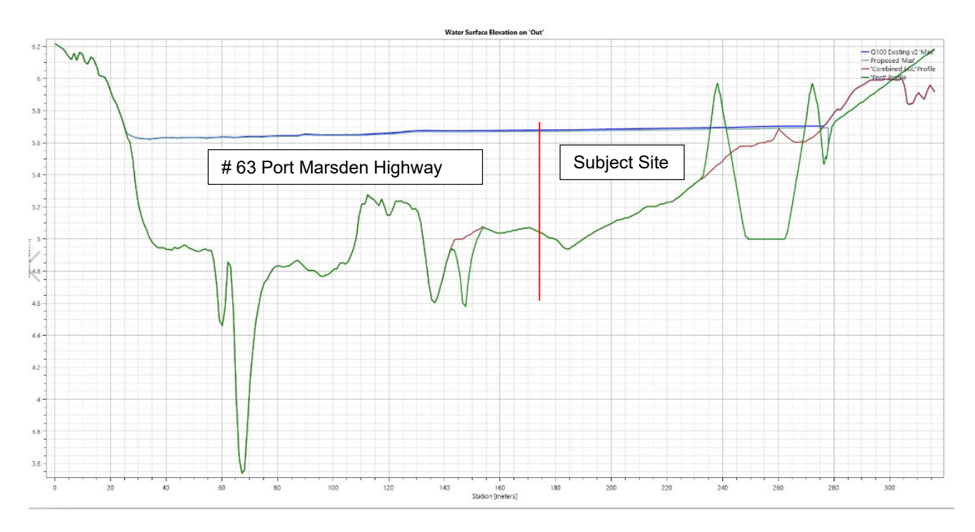
Figure 2: Downstream flood depth cross section