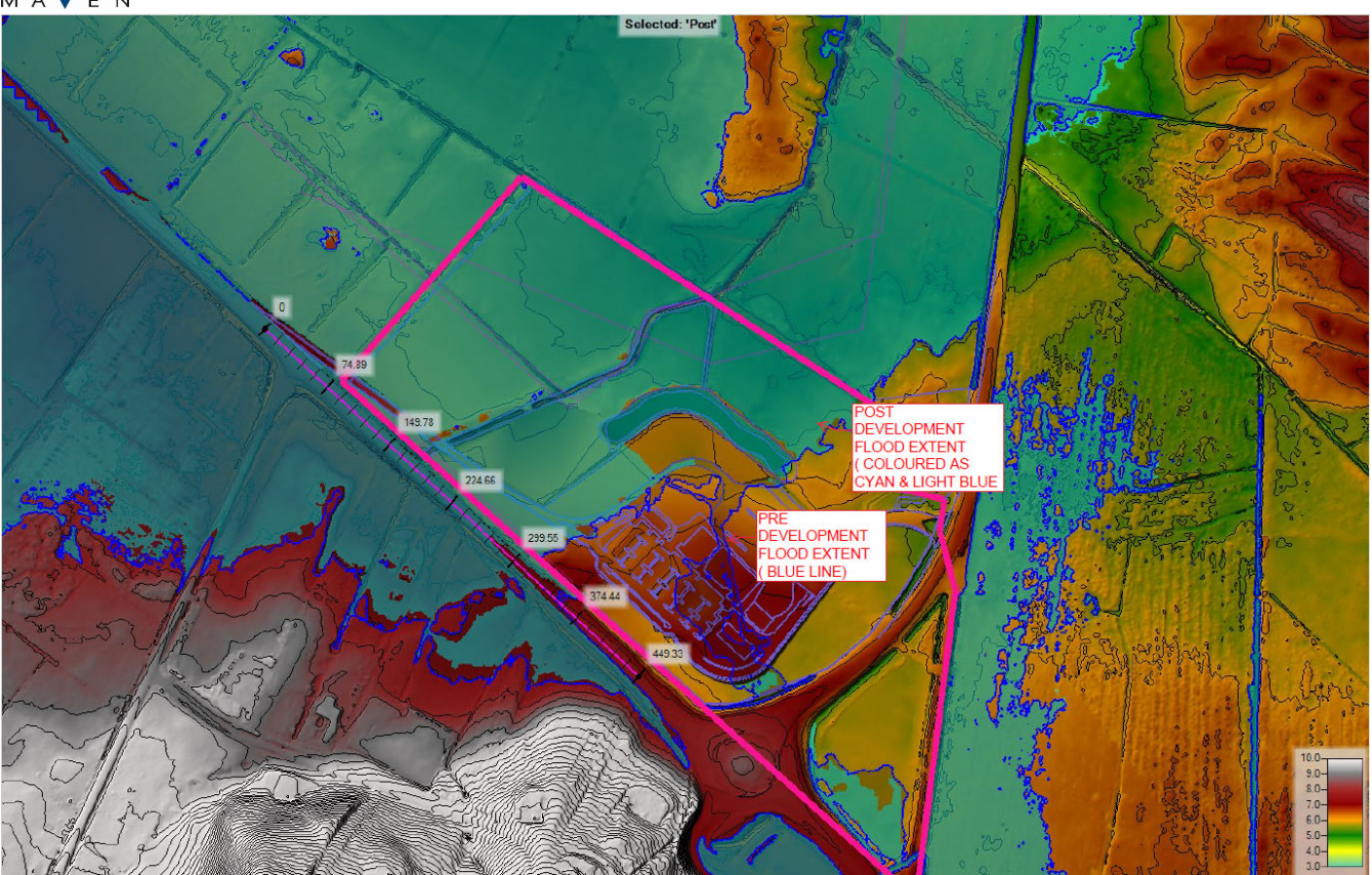
Figure 3: Upstream cross section and flood extent