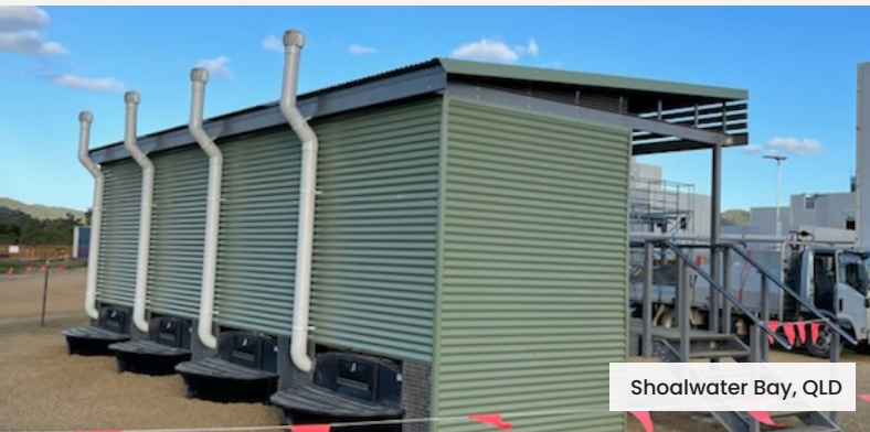
Shoalwater Bay, QLD

Today's public service engineers face significant challenges – do more with less, sooner, while being more ecologically sustainable, saving money and reducing risk all around. LooCube is stepping up to help address these challenges.