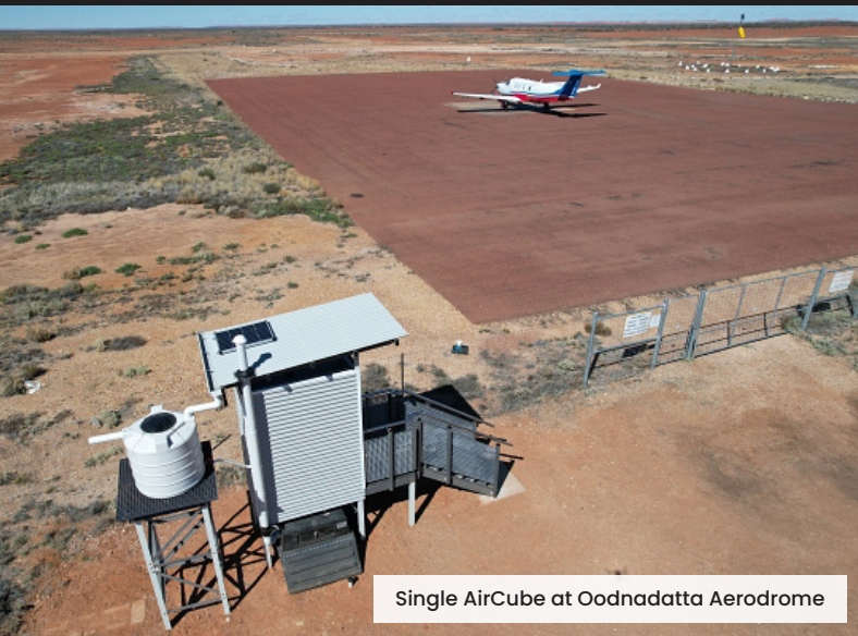
Single AirCube at Oodnadatta Aerodrome