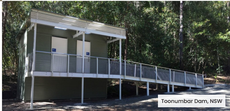
Toonumbar Dam, NSW