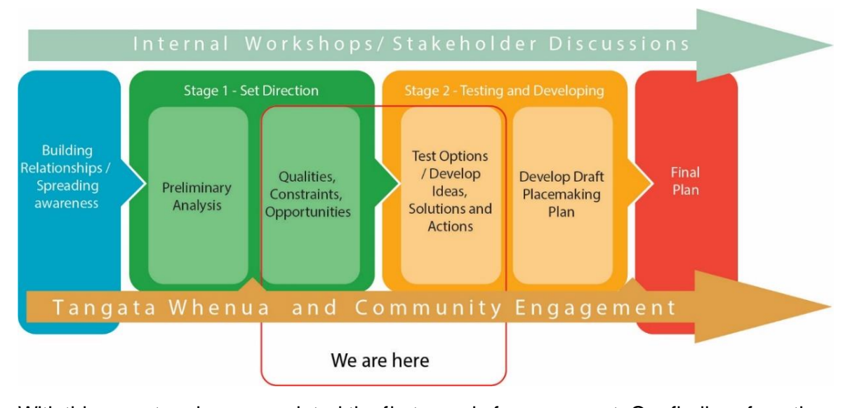
Figure 1 Placemaking plan development process

With this report we have completed the first round of engagement. Our findings from the community engagement, internal workshops, discussions with external stakeholders and the