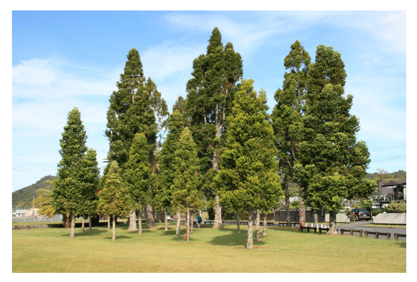
Kauri Grove Photo source: Simon Cocker Landscape Architecture (December 2012)