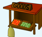
Fruit & veg stall