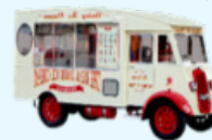
Ice cream van