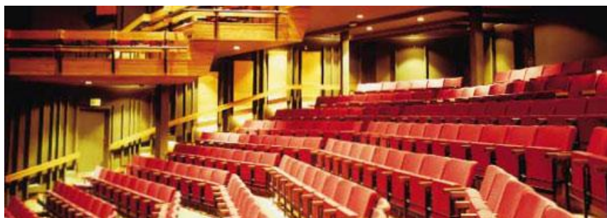
Figure 4. The Capitaine Bourgainville Theatre, Forum North.

The Capitaine Bourgainville Theatre is located in the Forum North complex. It has capacity of 366 people and can cater to a range of events including intimate theatre, music, entertainment events and meetings.