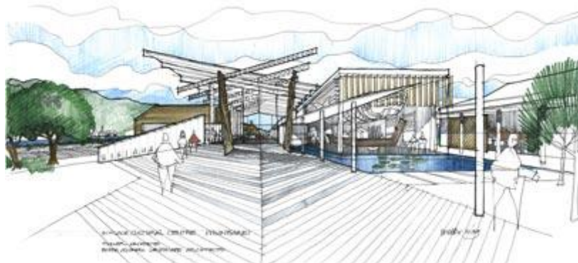
Figure 10. Artist impression of the Culture Centre - entry from the North West