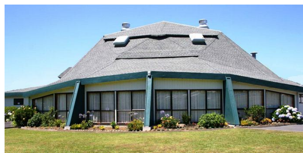
Figure 5. The Whangarei Theatre Company.

The Whangarei Theatre Company was built by company members in the mid 1980s. The centre contains a main auditorium (170 seating), the smaller Hatea room (100 seating), dressing rooms, a workshop and catering facilities. It is located in the lower Town Basin vicinity.