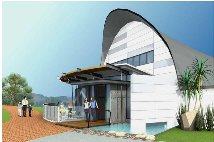
Figure 2. Illustrative concept of Whangarei Museum and Kiwi House.

The expansion of Whangarei Museum and Kiwi House is underway. The project, named Kiwi North, will provide a single new community facility and tourist attraction through the merger of a nocturnal Kiwi House and totally refurbished Museum with a new research facility, a new walk-through aviary containing endangered native species, special exhibition gallery, improved collection storage, meeting rooms, and enlarged shop and a quality café.