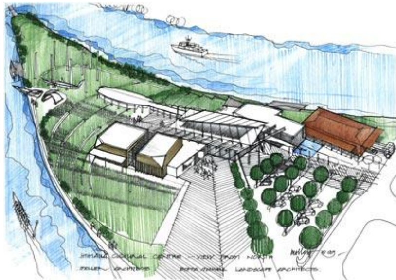
Figure 9. Artist impression of the Culture Centre - view from the north.

building complex. The centre if developed would provide for cultural as well as educational facilities for Whangarei and the Northland Region (Moller Architects, 2010).