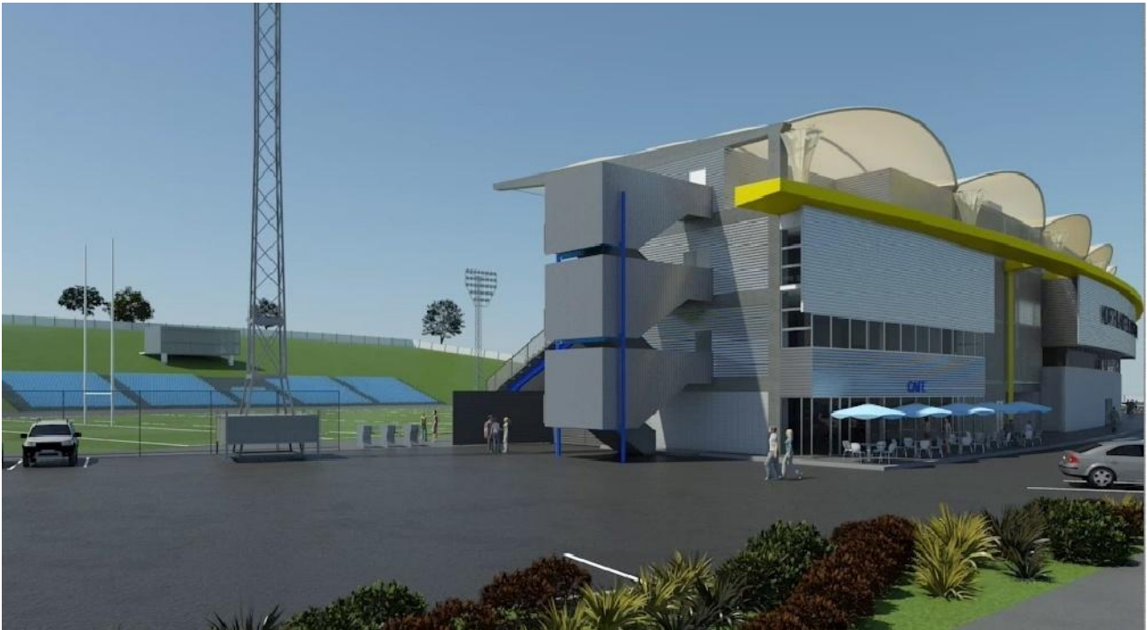
Figure 7. Northland Events Centre.

The new Events Centre will have the positive effect of providing a regional sporting and community facility which will be of benefit to the whole of Northland. It will also provide a conference facility for up to 1,000 people.