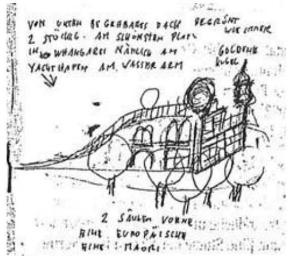
Figure 3. An original sketch for the old Northland Regional Council building by Hriedensreich Hundertwasser in 1993.

A Hundertwasser Museum has been proposed for the Town Basin to act as a centrepiece for arts and culture in Whangarei. The famous Austrian artist, Friedensreich Hundertwasser, sketched a design for the former Northland Regional Council building at the Town Basin in 1993. The building is now owned by Whangarei District Council. It is proposed to develop the building according to Hundertwasser's original design.