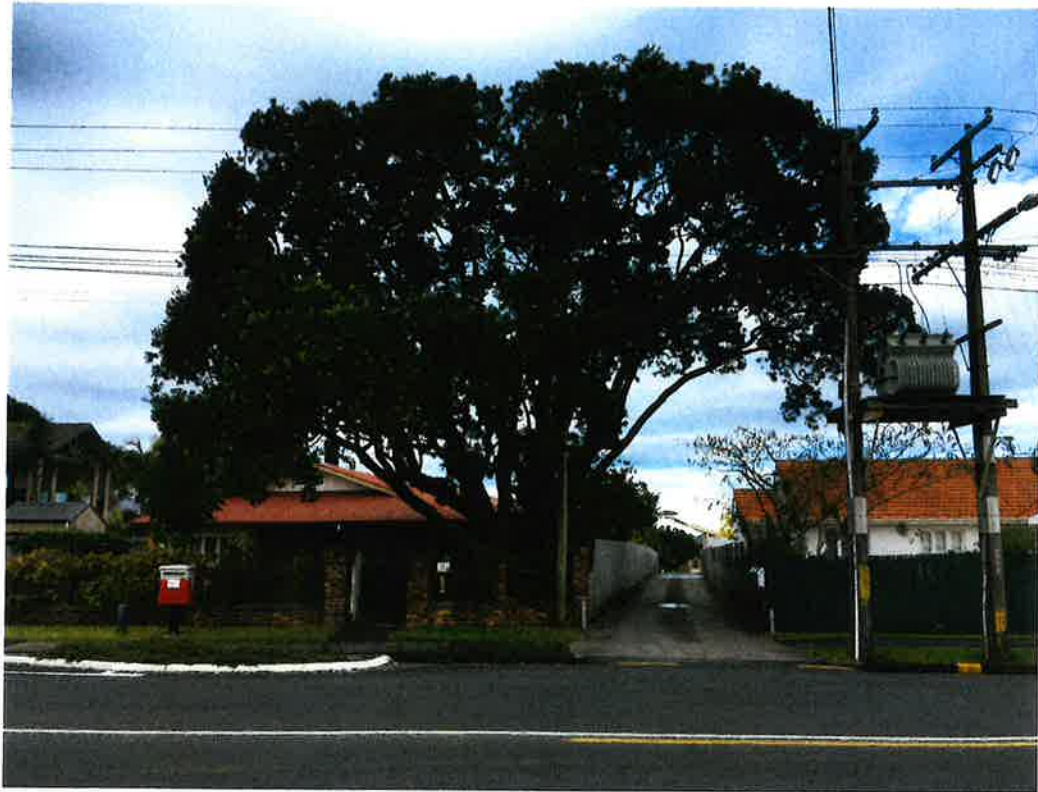
View from the street