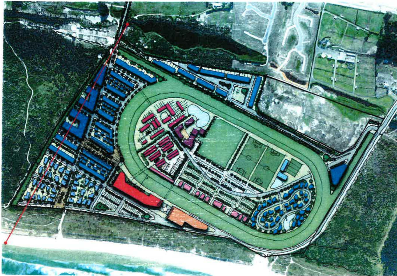
OPTION 1 ILLUSTRATIVE MASTERPLAN scale 1:5000 @ A3