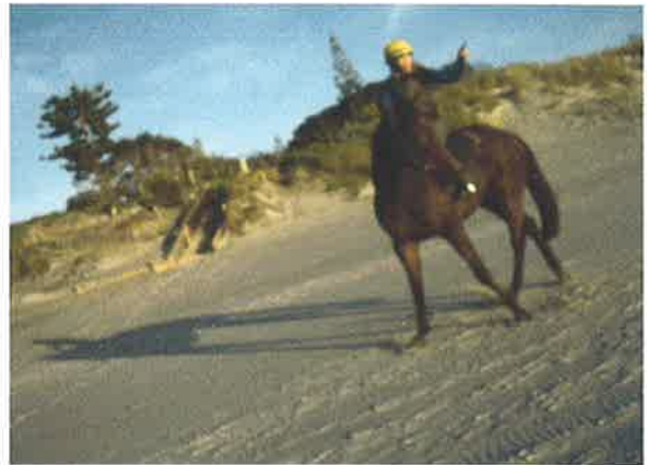
Horse & rider beyond 2nd storm water outlet