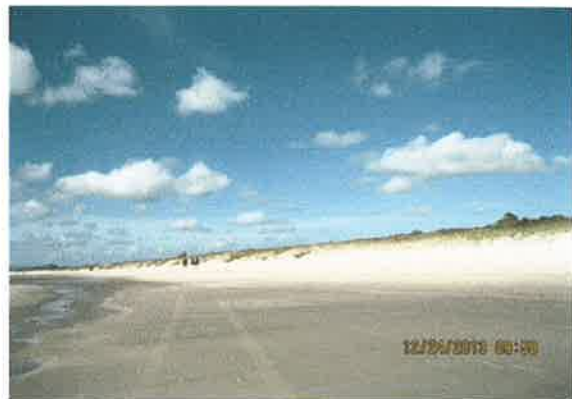
Race horses being trained above high water mark