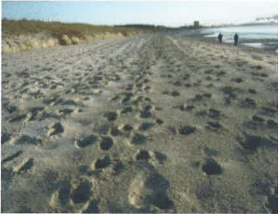
Horse hoof prints in the soft sand close to the toe of the dune and across the beach.