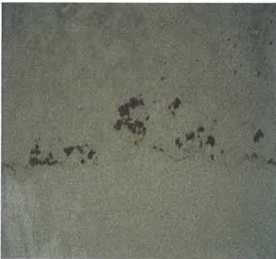
Horse faeces broken up by tidal action