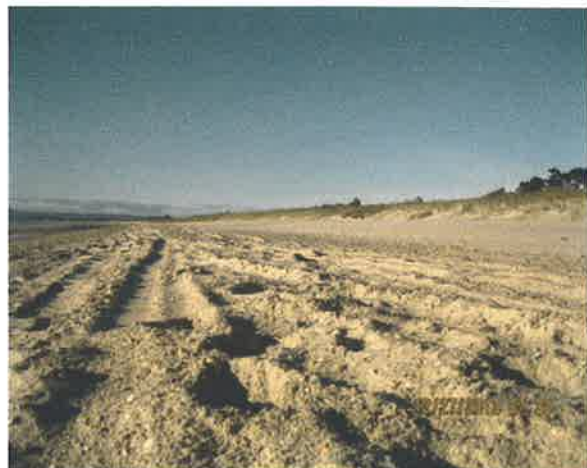
Tyre marks (and horse) on the Ruakaka Beach