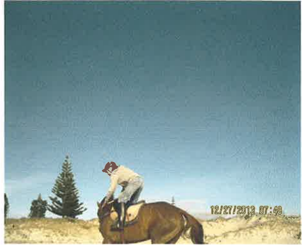
The person taking the photos above was within 50 meters of this horse and rider which is contrary to the Racing Club's Code of Conduct.(outside the village)