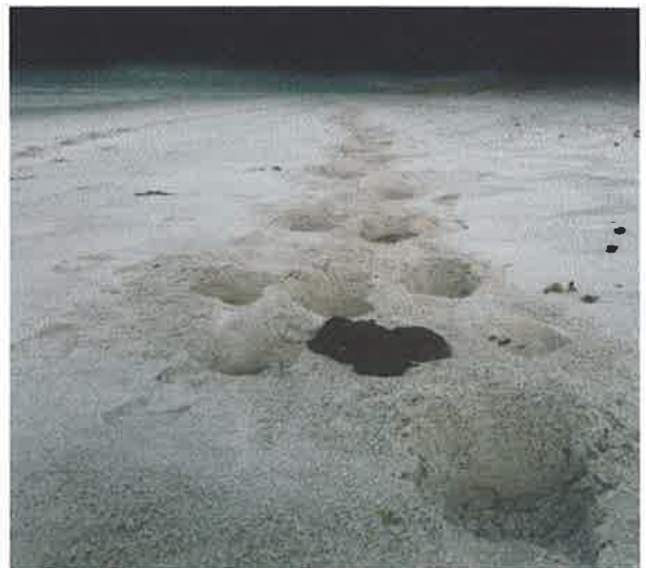
Fresh horse faeces – Public health issue!