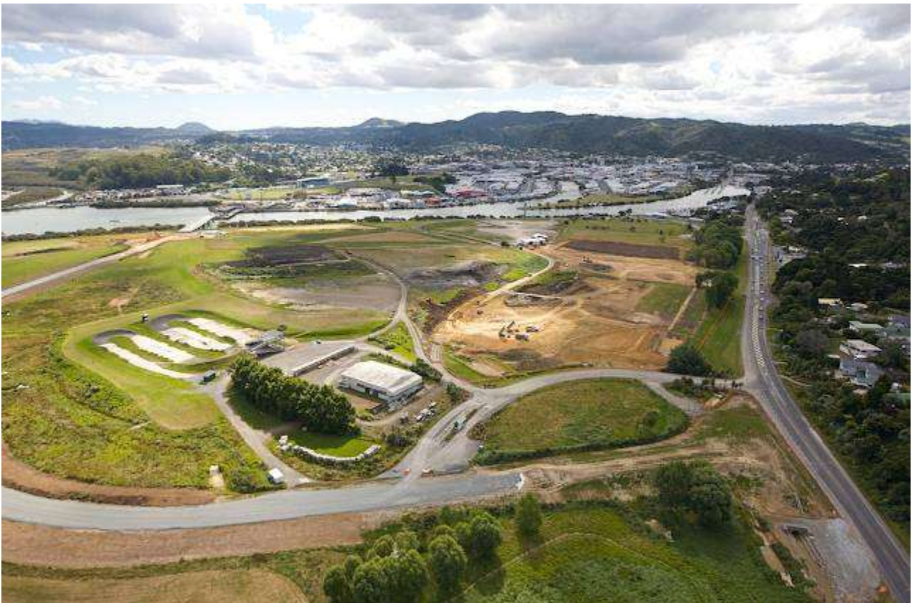
Pohe Island and Surrounds