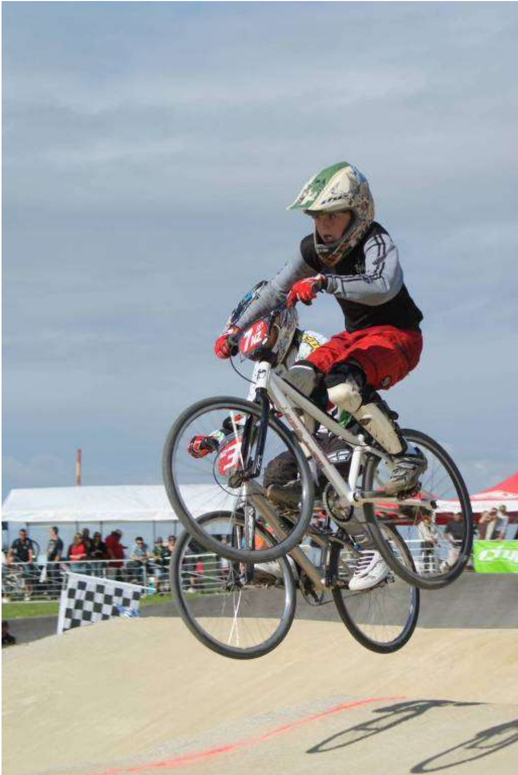
Action on the BMX track at William Fraser Memorial Park on Pohe Island (2009)