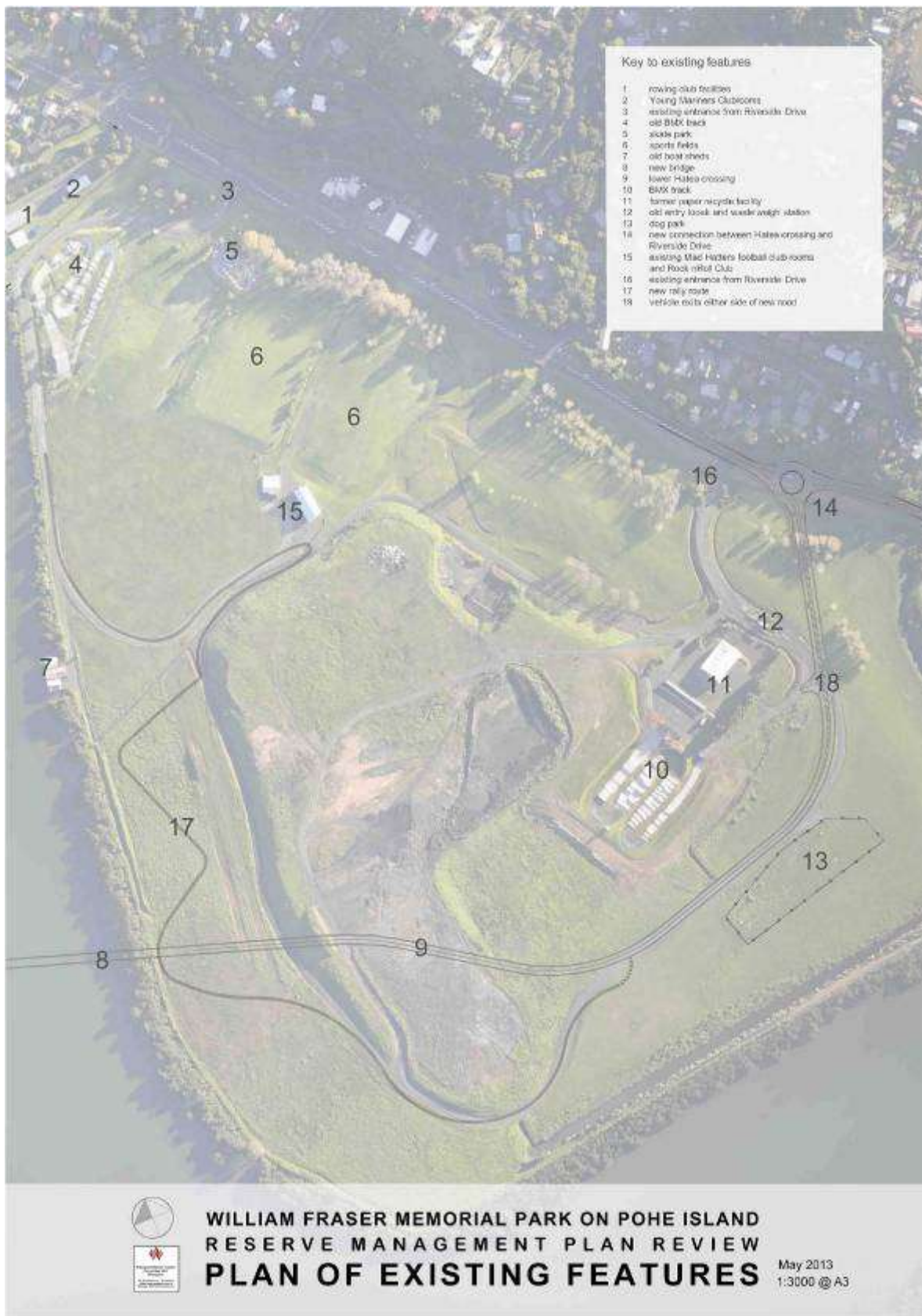
Figure 2 Pohe Island – Existing Features