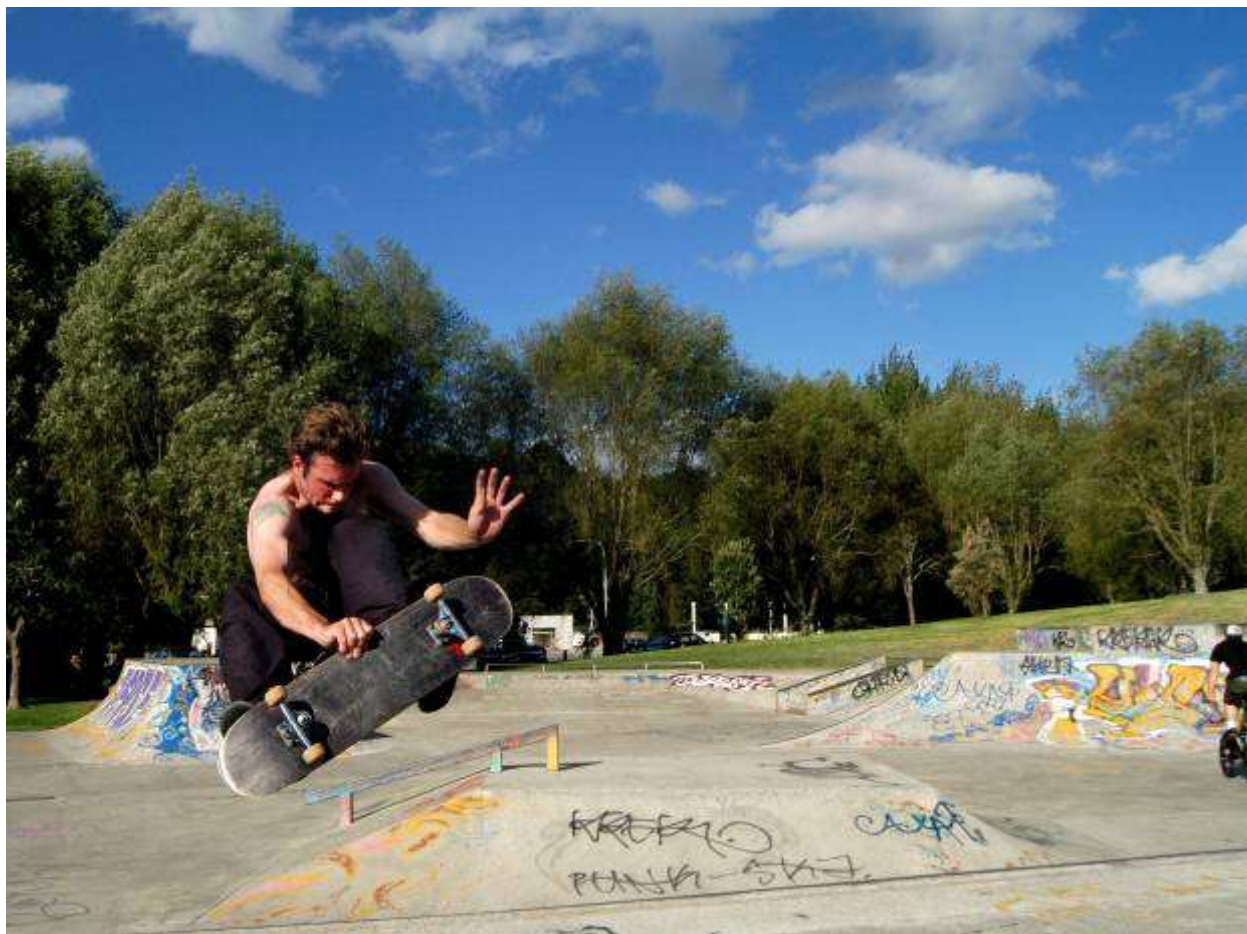
Skate park user in flight